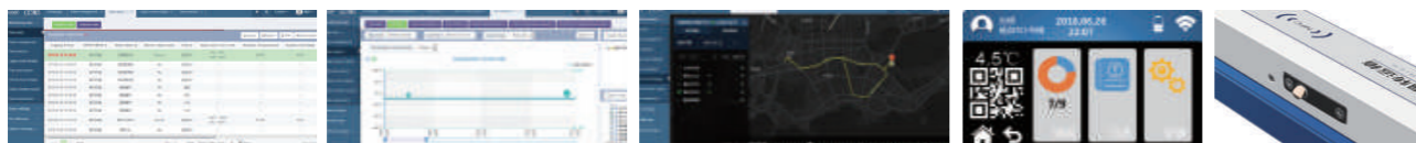
Temperature data upload record